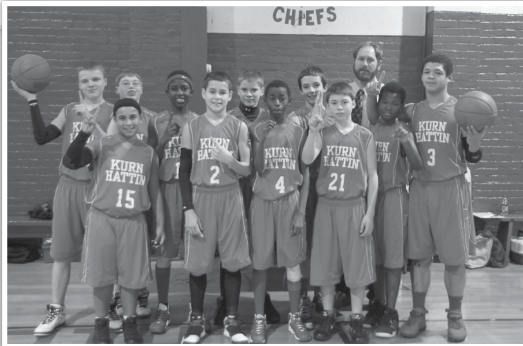
The Kurn Hattin Chiefs played a fantastic season, ending with second place in the Connecticut Valley League Tournament.